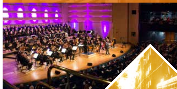
Norrköping Symphony Orchestra