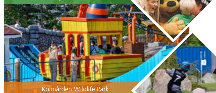
Kolmården Wildlife Park