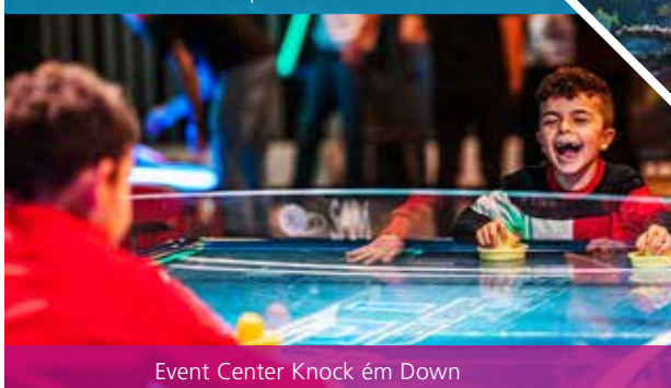
Event Center Knock ém Down