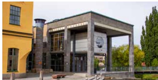
Louis De Geer Concert & Congress

Norrköping's cultural life is crackling and offers something for all tastes. The wide offering becomes very clear on Kulturnatten, which takes place the last weekend in September each year. Here are some tips on what you can enjoy!