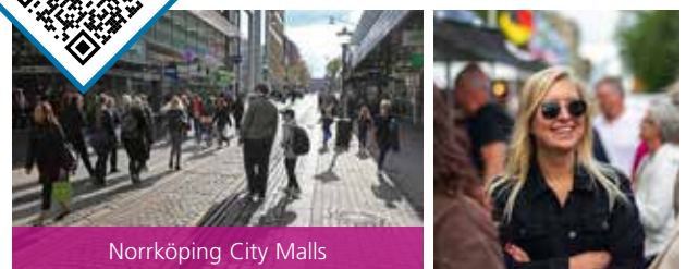
Norrköping City Malls