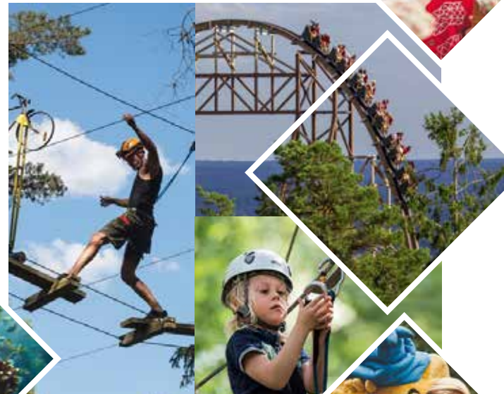
Sörsjön Adventure Park